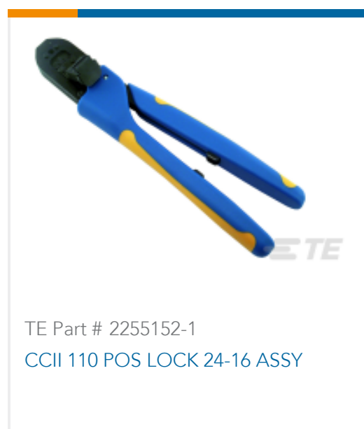
TE Part # 2255152-1 CCII 110 POS LOCK 24-16 ASSY