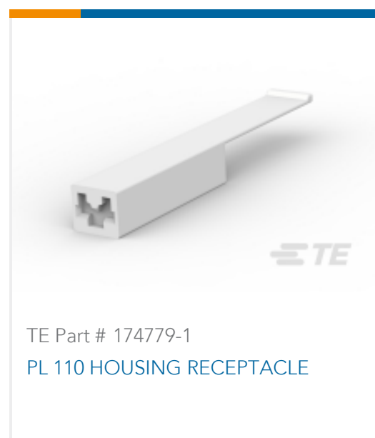
TE Part # 174779-1 PL 110 HOUSING RECEPTACLE